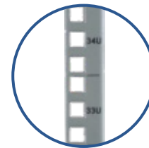
Standard U marking

Available in 42 RU Variants with 650, 800,1000 & 1200 Deep configurations and 600 Width configurations.